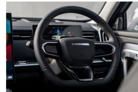
Steering Wheel with Multi-functional Controls