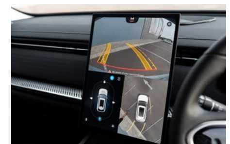
Rear Cross Traffic Assist with Braking