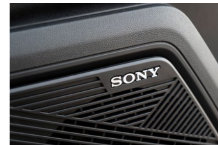
Sony Premium Sound System