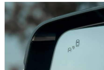
Blind Spot Detection