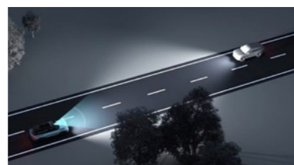
Intelligent High Beam Control