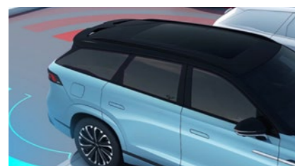
Rear Cross Traffic Assist with Breaking