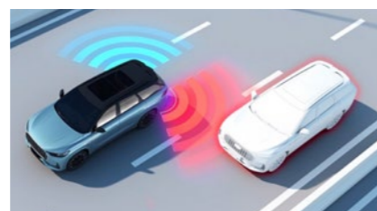
Blind Spot Detection