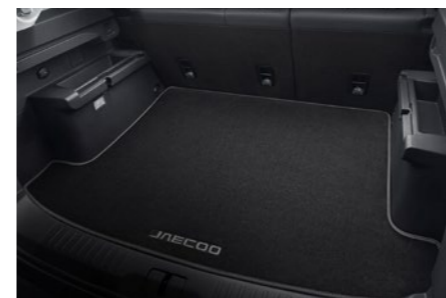
412ℓ to 1335ℓ Luggage Capacity