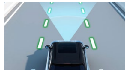
Lane Keeping Assistance