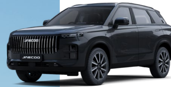
Carbon Crystal Black