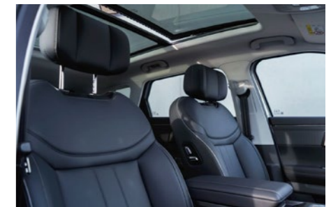
Heated & Ventilated Front Seats with Cushions and Backrests