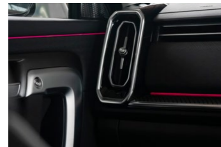
Ambient Interior Lighting