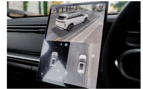
360° HD Panoramic Camera